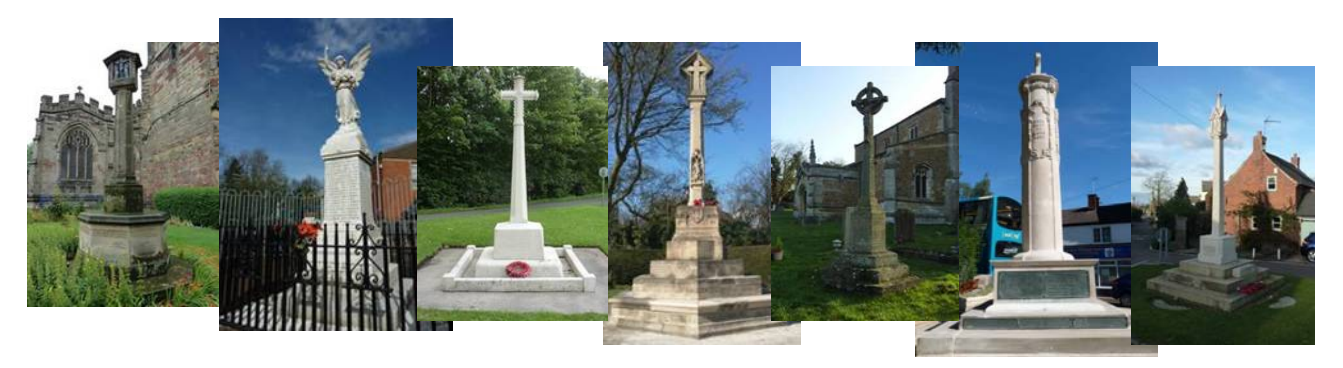
Selection of war memorials offered grants by the Project so far!