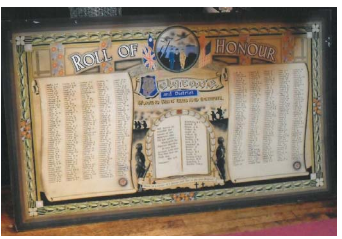
WW1 (left) and WW2 (above)